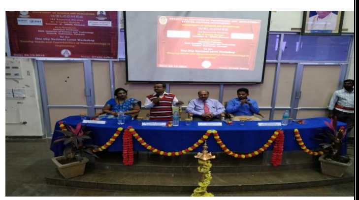
One day National Level workshop on "Ensuring Needs and Opportunities of Nanotechnology in Engineering" organized by Science and Humanities on 22<sup>nd</sup> December 2018.