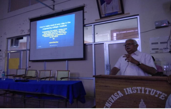
Guest Lecture on "How to make most of your stay in the Engineering college/Institute" on 20th September 2018.

Department of Science & Humanities, SITAMS Newsletter: July–December (2018)