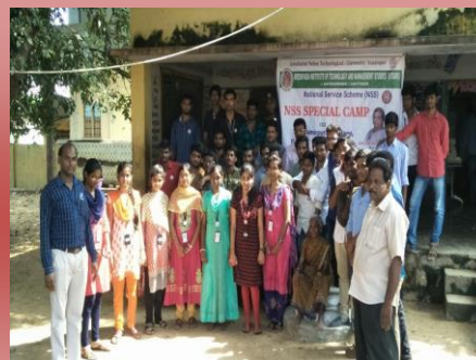
Special Camp Conducted in 197, Ramapuram Village(03-10-2017 To 09-10-17)