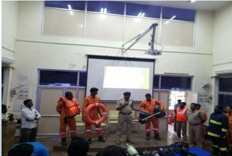
Fire Awareness Program (7/7/2017)

Our students as NSS Volunteers continuously showing leadership skills and serving rigorously for community health care, literacy drives, environmental protection, Blood donation camps, informative lecture on human values regularly to the society by visiting nearby villages and educating and helping the poor and the destitute. This time NSS has also organized many activities.