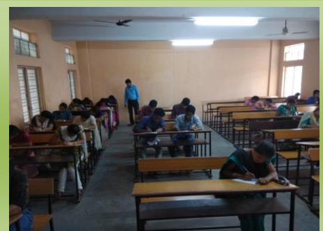
College Level Youth Festival (30-12-2017)