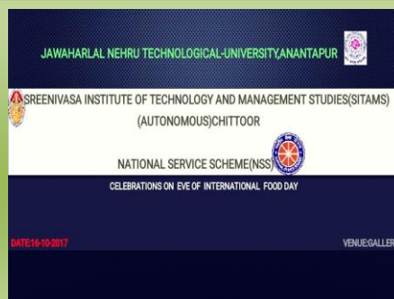
Worls Food Day Celebrations (16-10-2017)