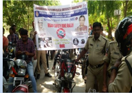
Road safety bike rally (20/9/2017)