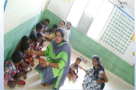
Help to orphan childrens (5/9/2017)