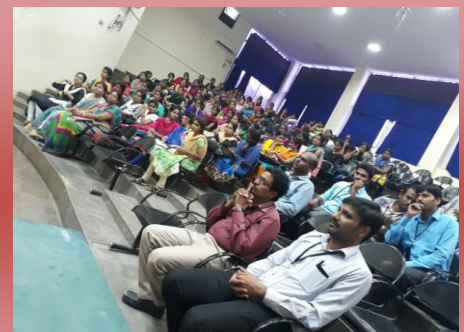
Dr.APJ.AbdulKalam Birthday / International Students Day / Global Hand Wash Day (15-10-2017)