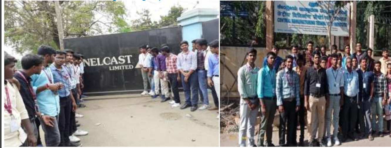
Visited NELCAST limited (7-3-2020)

• SITAMS, Mechanical Engineering department students visited NELCAST, Gudur, Nellore(dt) on 7-3-2020.