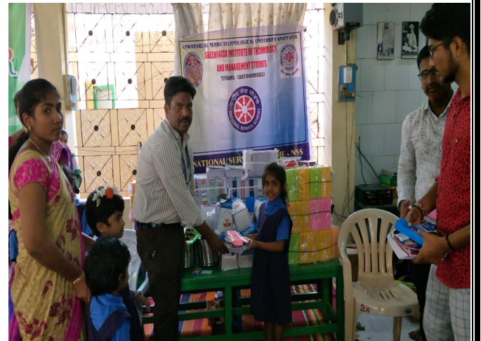
Student Kit Distribution to Poor Students who are studying in Govt. Schools in around Chittoor(19-08-2019)