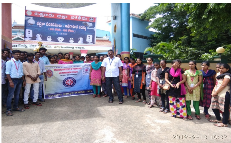
Participated in Awareness Program on "Our Safety in Our Hands" conducted by Chittoor Police Dept (13-09-2019)