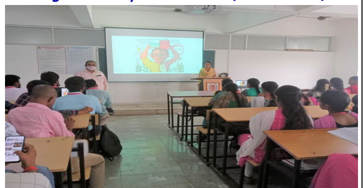
National Education day(11.11.2019)