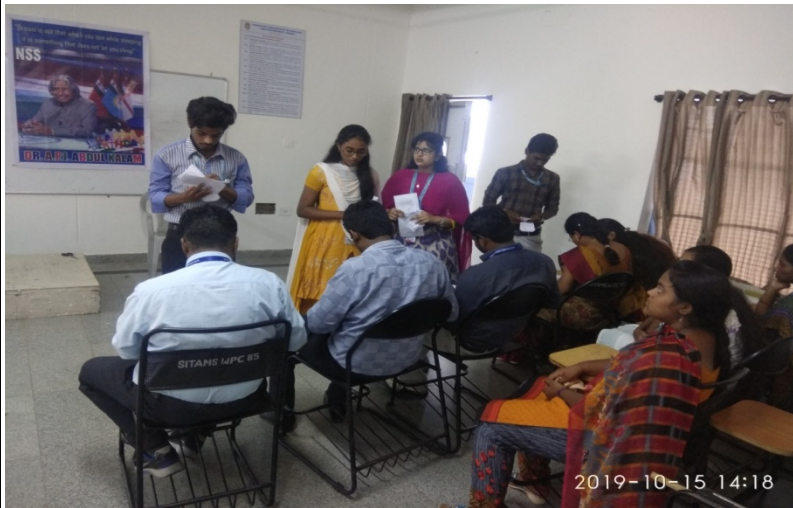
Quiz and Elocution Competitions on the eve of Dr.APJ.Abdul Kalam Birthday (15-10-2019)