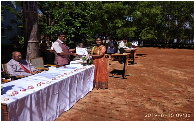
Independence Day Celebrations (15-08-2019)