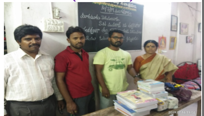
Provided Note Books to Orphan Students who are staying in Amma Vodi Ashramam (17-07-2019)