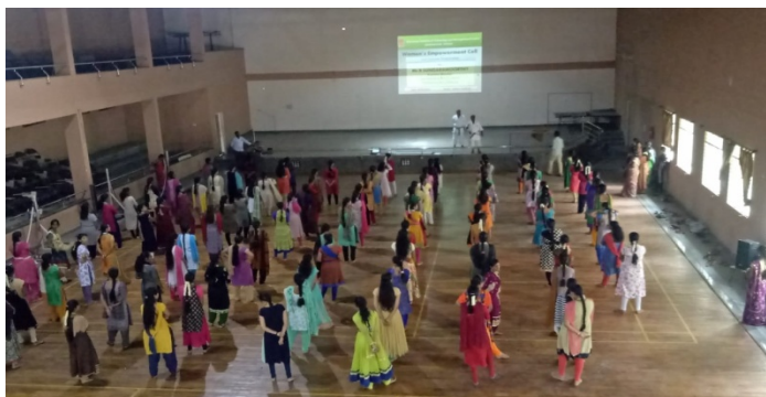
Self Defense Programme (19-07-2019)