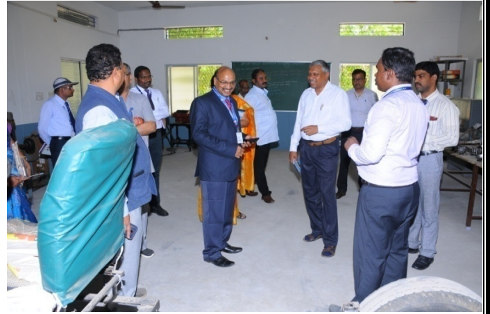
Standing Committee visit for extension of Autonomous status (14-06-2019 & 15-06-2019)