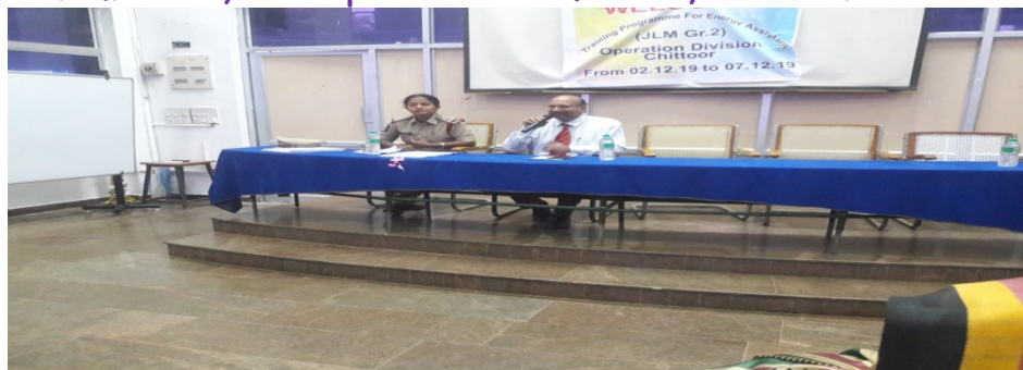
An Awareness camp "Anti Sexual Harassment" (07-12-2019)