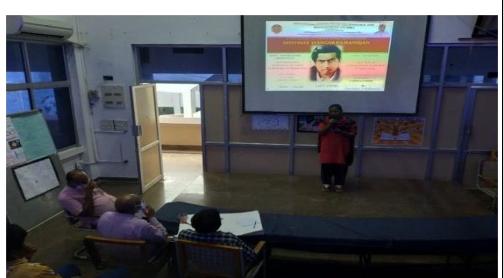
National Mathematics day(20.12.2019)