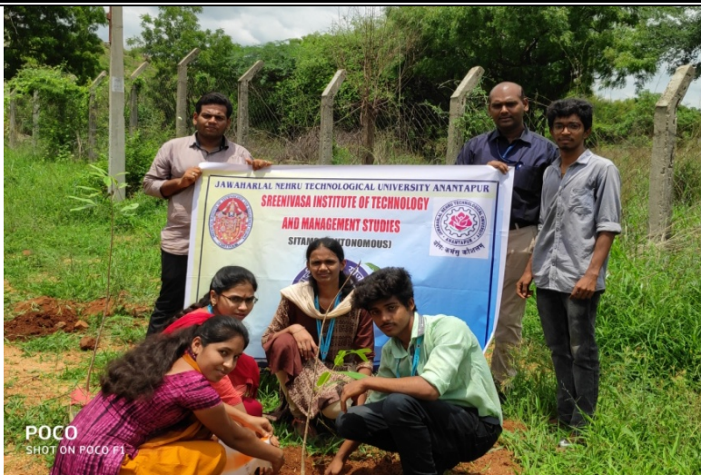
Tree Plantation in SITAMS Hostel (08-08-2019)