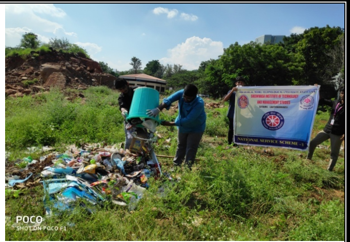
Campus Clean to make Plastic Free Campus (01-10-2019)