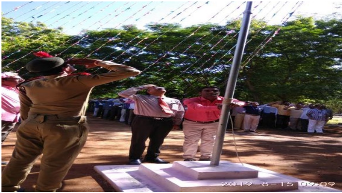
Independence Celebrations (15-08-2019)