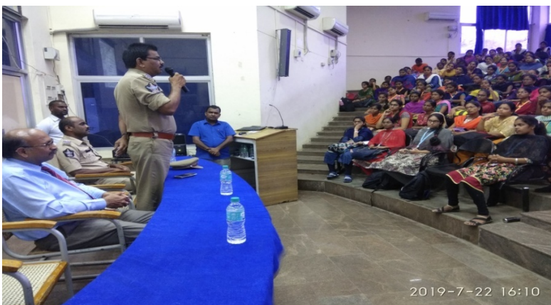
Anti Ragging Awareness to Students by Chittoor Police Department (23-07-2019)