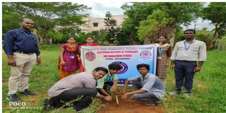
Tree Plantation in SITAMS (12-07-2019)