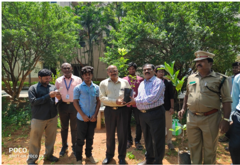
Tree Plantation and Distribution (01-10-2019)