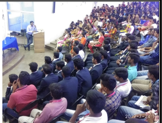
mPassPort APP Awareness to Students (24-07-2019)