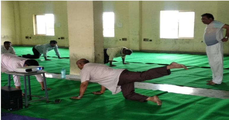
International Yoga Day Celebrations (21-06-2019)

Our students as NSS Volunteers continuously showing leadership skills and serving rigorously for community health care, literacy drives, environmental protection, Blood donation camps, informative lecture on human values regularly to the society by visiting nearby villages and educating and helping the poor and the destitute. This time NSS has also organized many activities.