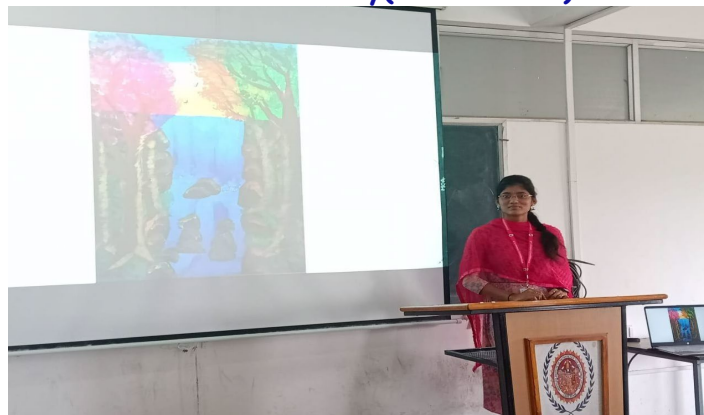
Children's Day Celebrations(13.11.2019)