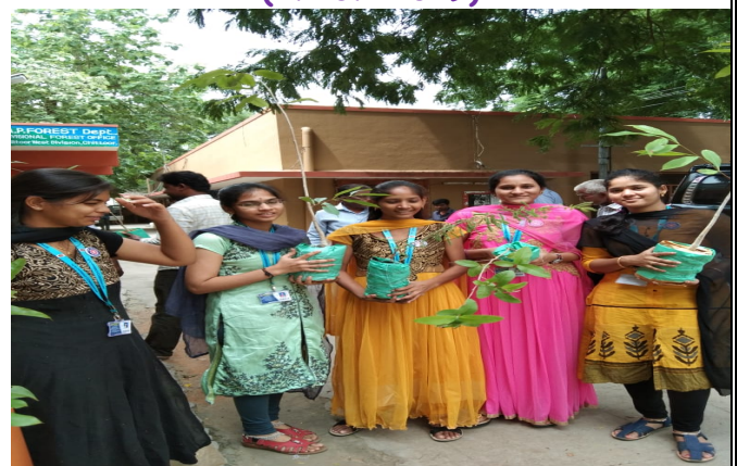
NSS Volunteers Participated in Trees Distribution conducted by Forest Dept, Chittoor (01-08-2019)