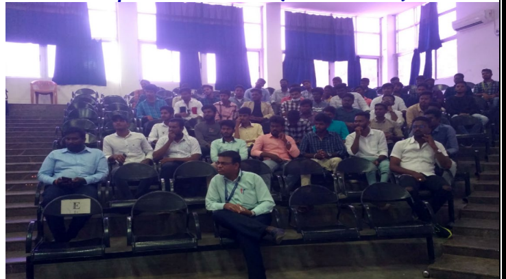
Workshop on Stock Market Trading (23.10.2019)