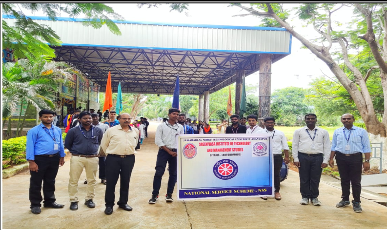
NSS Foundation Day Celebrations (24-09-2019)