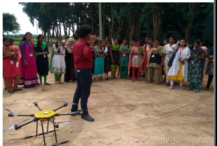
A 3-Day Entrepreneurship Awareness Camp (14-10-2019 to 16-10-2019)