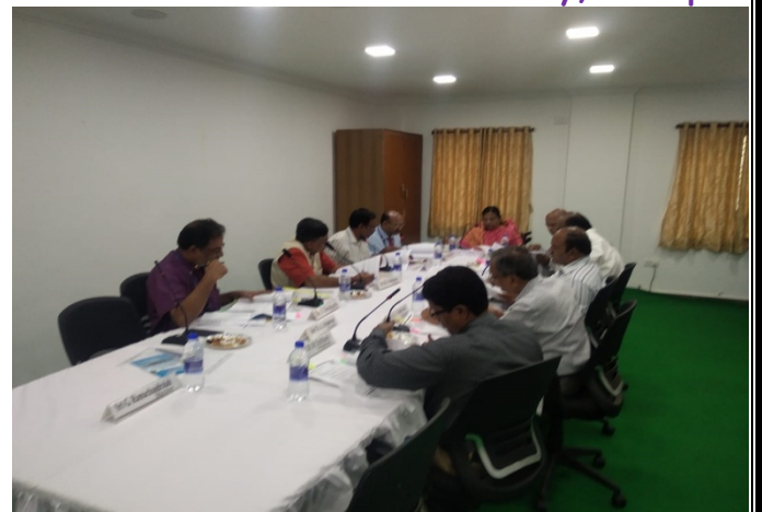
Governing Body Meeting (20-12-2019)