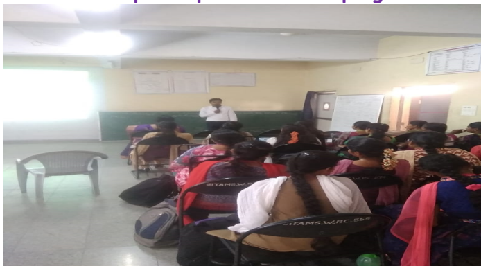
An Awareness Programme "Stress Management at the working place" (10-07-2019)