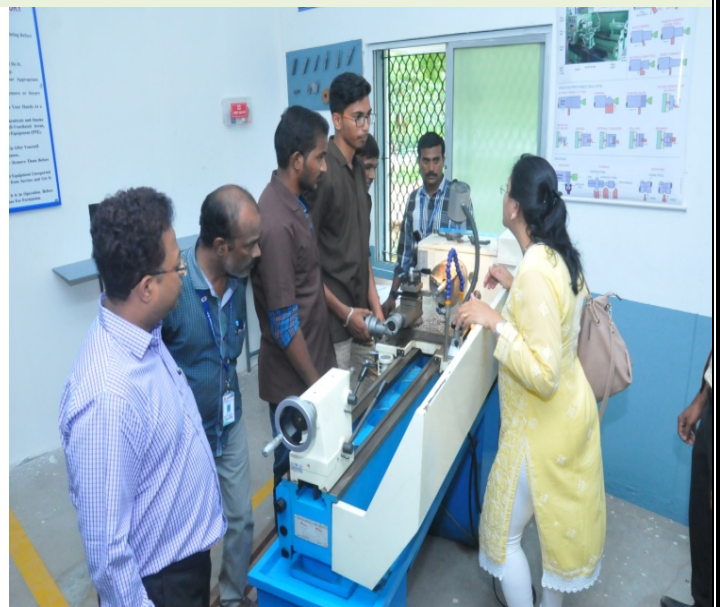
Standing Committee visit for NBA accreditation (30-08-2019, 31-08-2019 & 01-09-2019)