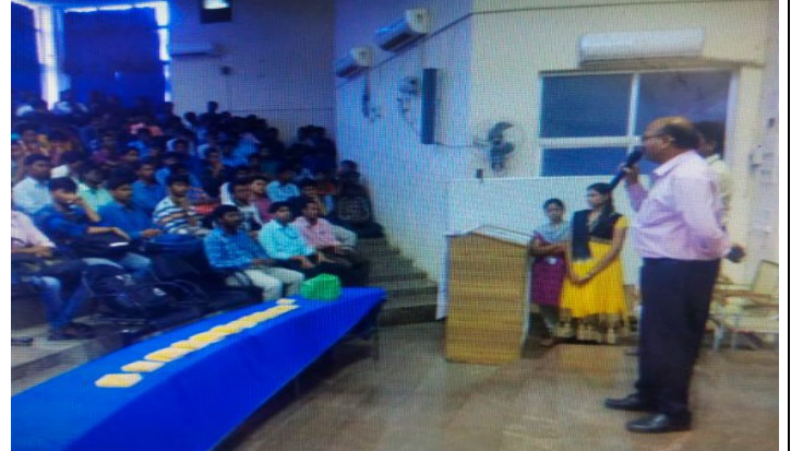
Engineer's day Celebrations(15.09.2019)