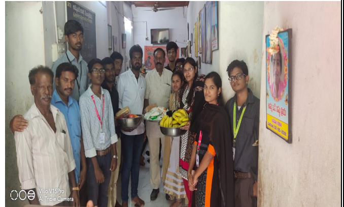
Provide Fruits, Bread and Milk to orphans in Old Age Home (Ammavodi Ashramam) (11-07-2019)