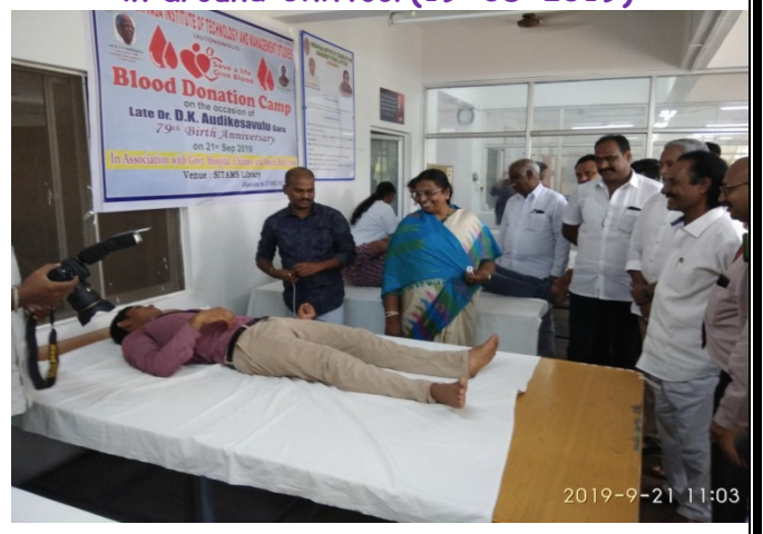
Blood Donation Camp (21-09-2019)