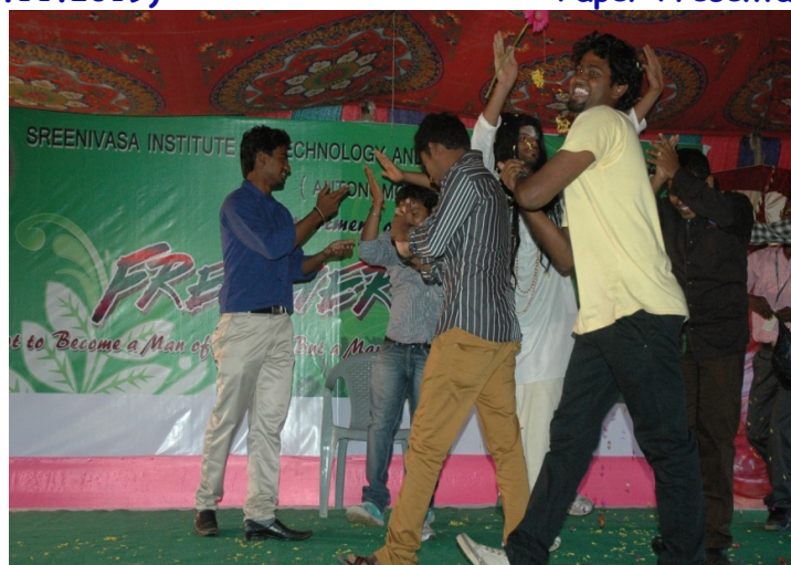
Freshers Day Celebration (25.9.2019)