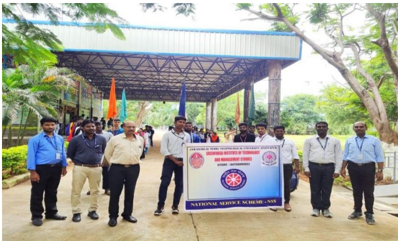
NSS Foundation Day Celebrations (24-09-2019)