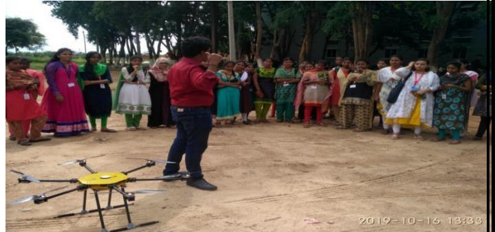
A 3-Day Entrepreneurship Awareness Camp(14-10-2019 to 16-10-2019)