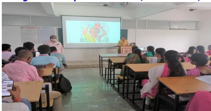
National Education day(11.11.2019)