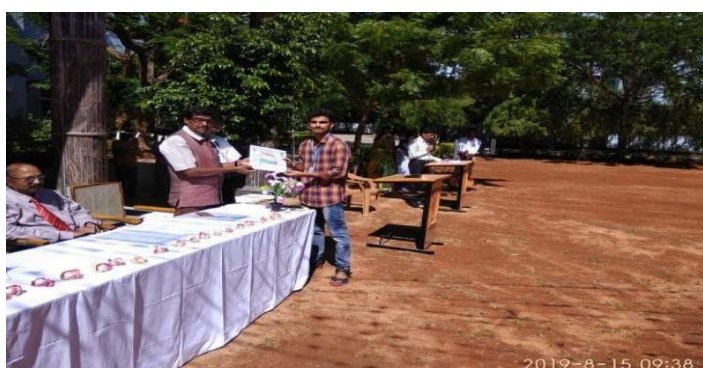
Independence Celebrations (15-08-2019)