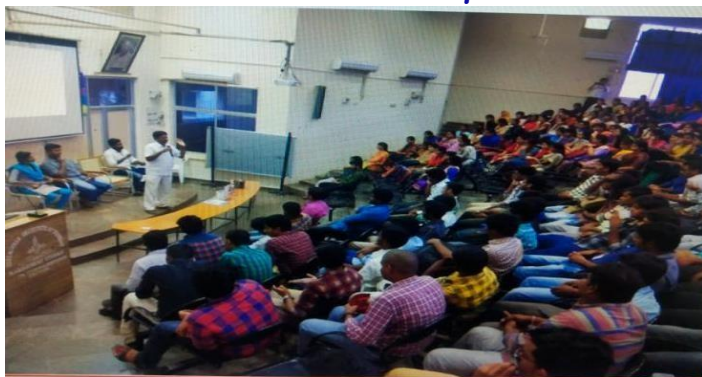
Teachers day Celebrations(05.09.2019)