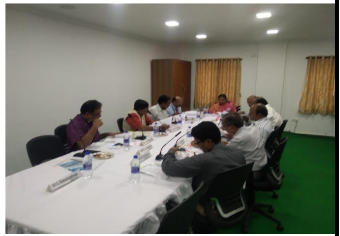
Governing Body Meeting(20-12-2019)