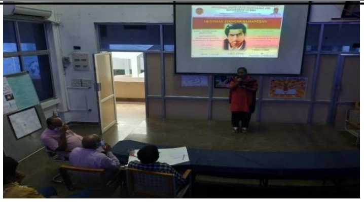
National Mathematics day(20.12.2019)