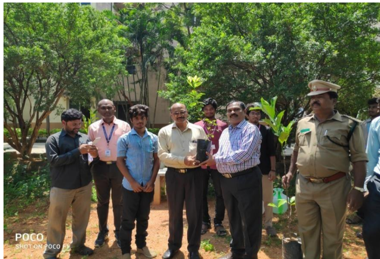
Tree Plantation and Distribution (01-10-2019)