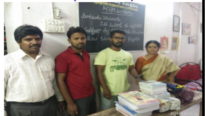
Provided Note Books to Orphan Students who are staying in Amma Vodi Ashramam (17-07-2019)