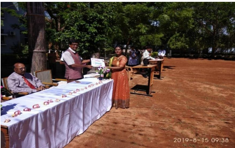
Independence Day Celebrations (15-08-2019)