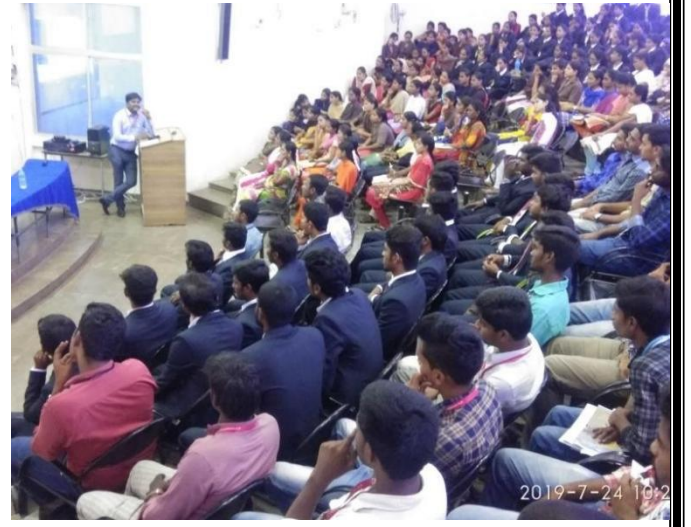
mPassPort APP Awareness to Students (24-07-2019)