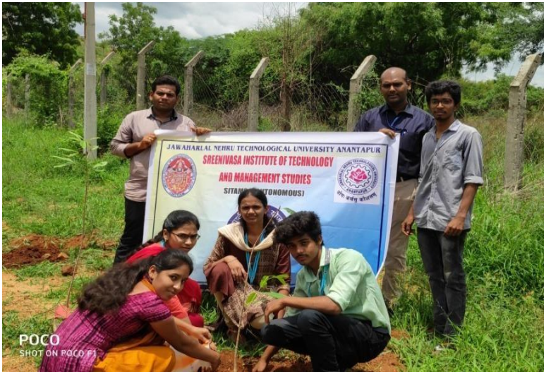
Tree Plantation in SITAMS Hostel (08-08-2019)