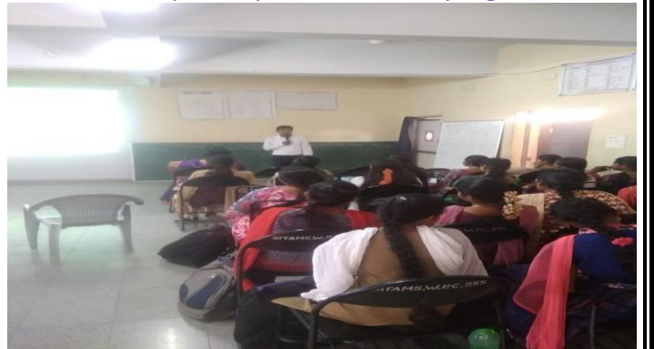
An Awareness Programme "Stress Management at the working place" (10-07-2019)