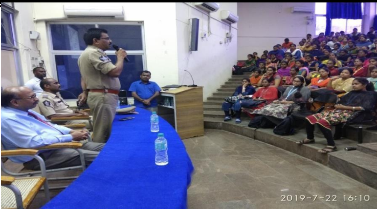
Anti Ragging Awareness to Students by Chittoor Police Department (23-07-2019)