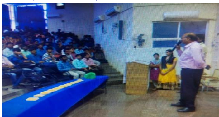
Engineer's day Celebrations(15.09.2019)