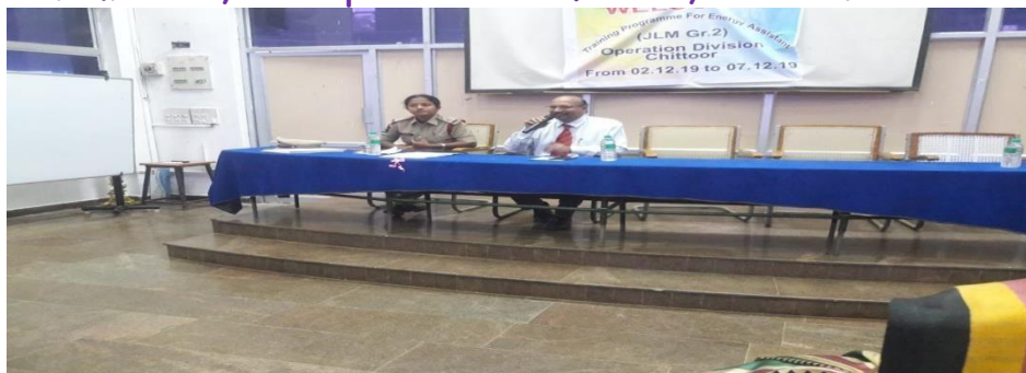
An Awareness camp "Anti Sexual Harassment" (07-12-2019)