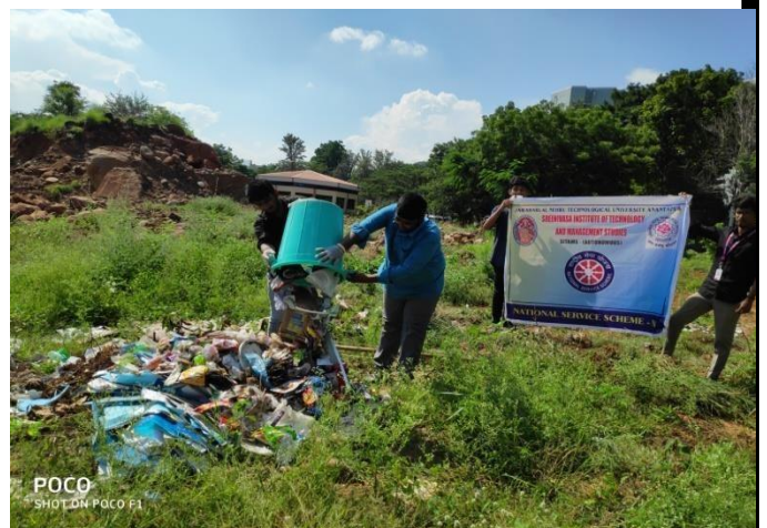
Campus Clean to make Plastic Free Campus (01-10-2019)