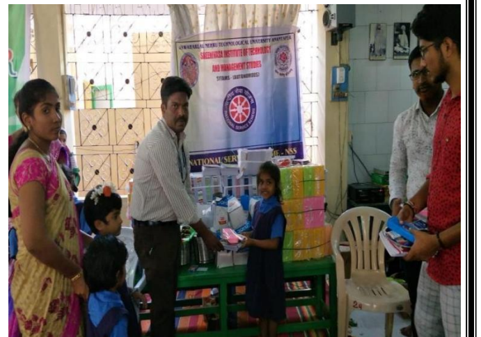
Student Kit Distribution to Poor Students who are studying in Govt. Schools in around Chittoor(19-08-2019)