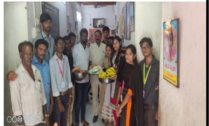
Provide Fruits, Bread and Milk to orphans in Old Age Home (Ammavodi Ashramam) (11-07-2019)