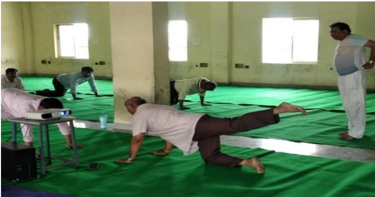
International Yoga Day Celebrations (21-06-2019)

Our students as NSS Volunteers continuously showing leadership skills and serving rigorously for community health care, literacy drives, environmental protection, Blood donation camps, informative lecture on human values regularly to the society by visiting nearby villages and educating and helping the poor and the destitute. This time NSS has also organized many activities.