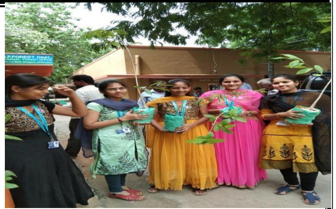
NSS Volunteers Participated in Trees Distribution conducted by Forest Dept, Chittoor (01-08-2019)