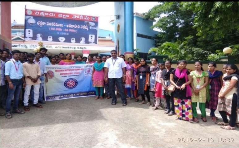
Participated in Awareness Program on "Our Safety in Our Hands" conducted by Chittoor Police Dept (13-09-2019)