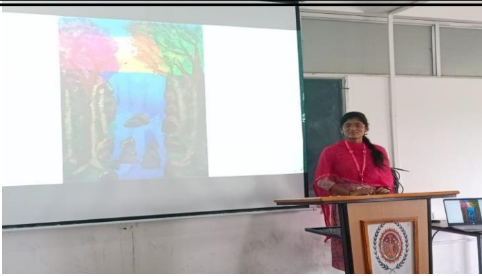
Children's Day Celebrations(13.11.2019)