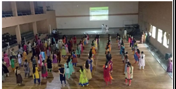
Self Defense Programme (19-07-2019)