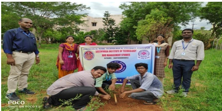
Tree Plantation in SITAMS (12-07-2019)