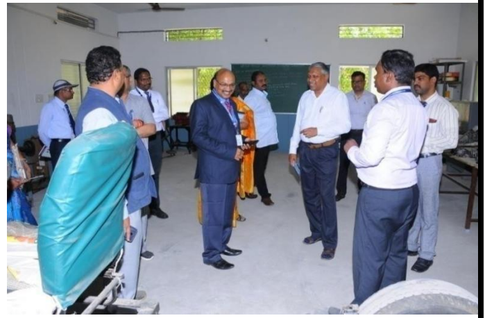
Standing Committee visit for extension of Autonomous status (14-06-2019 & 15-06-2019)