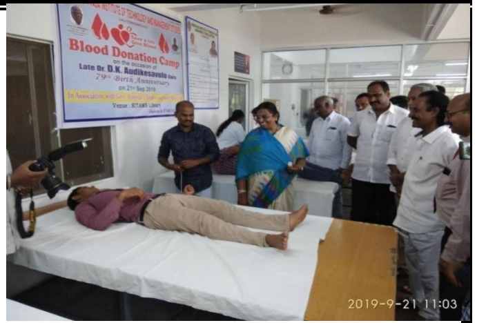
Blood Donation Camp (21-09-2019)