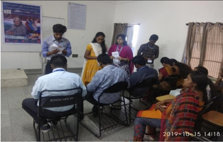
Quiz and Elocution Competitions on the eve of Dr.APJ.Abdul Kalam Birthday (15-10-2019)