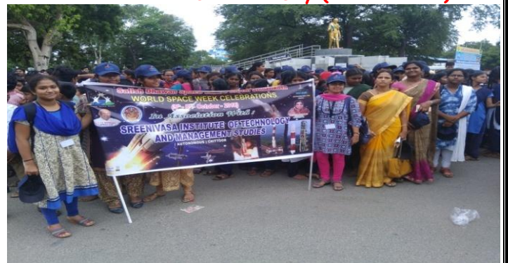
Participated in World Space Week Rally (06-10-2018)