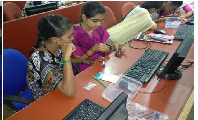
A Three day workshop on "Internet of Things using Arduino &Rasberry" during 17-09-2018 to 19-09-2018