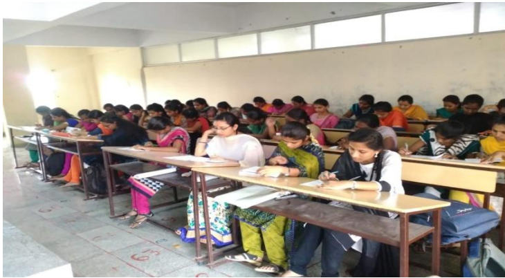
Essay Writing competition on the eve of completion of 125 years of Swami Vivekananda historical speech in Chicago (27-08-2018)