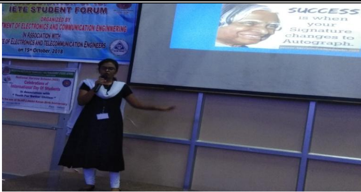
Dr. APJ. Abdul Kalam Birthday Celebrations (15-10-2018)