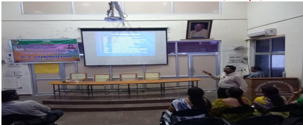
A Seminar on "Formulation of Research Proposals"