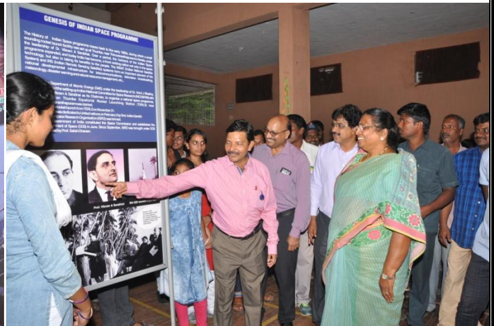
World Space Week-2018 Celebrations in association with Satish Dhawan Space Centre(SDSC)SHAR (04-10-2018 to 08-10-2018)