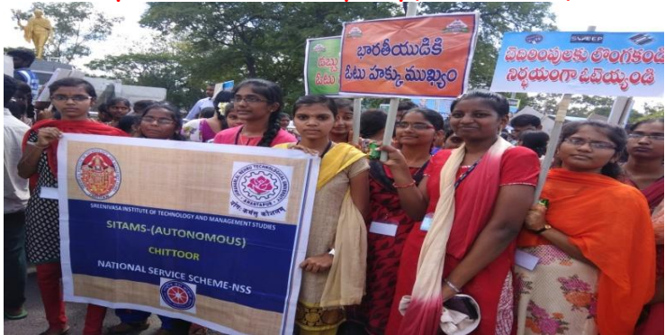
Voters Awareness Rally (27-09-2018)