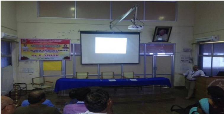
One Day workshop on "How to write a Research Paper & Research Proposal"