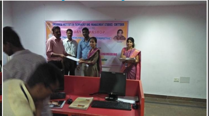
One day workshop on C Programming from Industry Perspectives on 19.09.2018