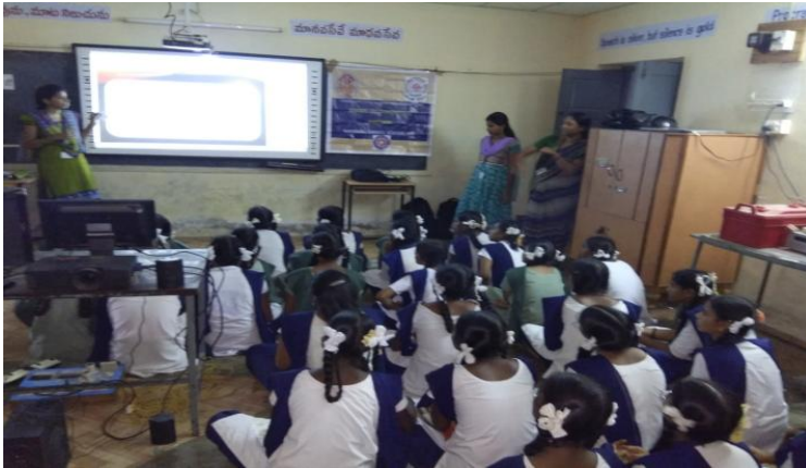
Awareness Program for Govt. School children, Doddipalli Village, Chittoor about Higher studies, Internet applications and Health Tips. (13-07-2018)

Our students as NSS Volunteers continuously showing leadership skills and serving rigorously for community health care, literacy drives, environmental protection, Blood donation camps, informative lecture on human values regularly to the society by visiting nearby villages and educating and helping the poor and the destitute. This time NSS has also organized many activities.