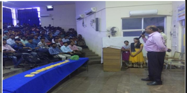
NSS Orientation Program on the eve of NSS Foundation Day (24-09-2018)