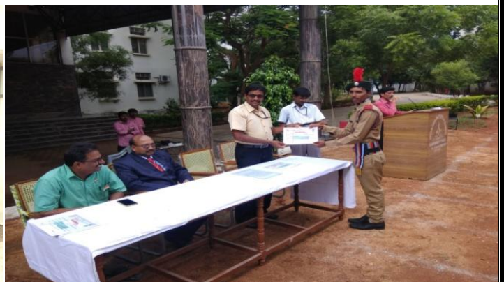
Independence day celebrations (15-08-2018)