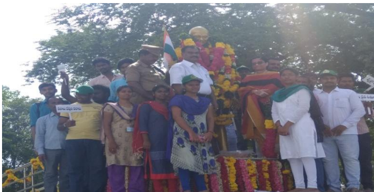
Participation in Plants Distribution and Awareness Rally in Chittoor on the eve of Gandhi Jayanthi in coordination with District Forest Office (02-10-2018)