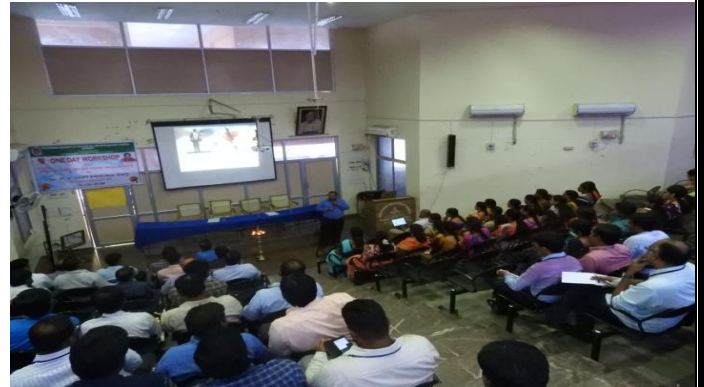
One Day workshop on "Indian Patent Laws and Patent Filing Process"