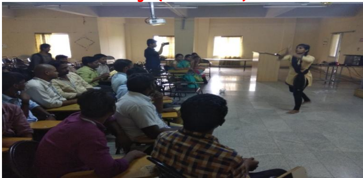
College level Gnanabheri Literacy and Cultural Competitions on Literacy Day(05-09-2018)