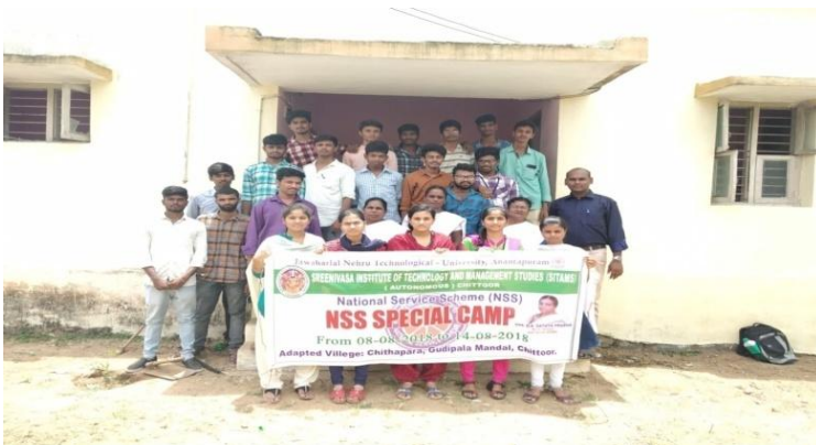
NSS Special Camp in Chithapara Village, Gudipala(MD), Chittoor (08-08-18 To 14-08-2018)