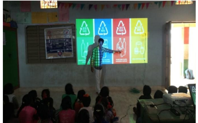
Awareness Program for Govt. School children, Cherlopalli Village, Chittoor about Environment and Higher studies (21-07-2018)