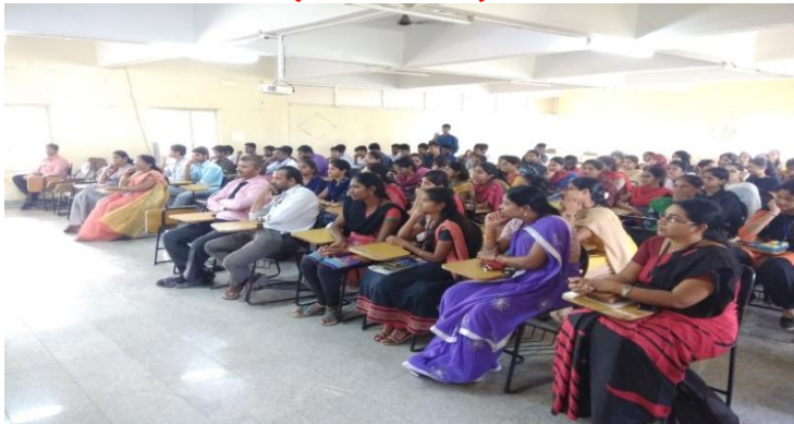
College Level Youth Festival Competitions (08-12-2018)