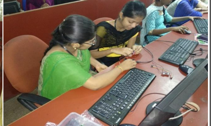
One week Hands-on Workshop on "Internet of Things" During 23-07-2018 to 01-08-2018.