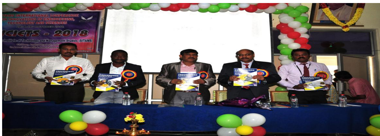
SITAMS International Conference on Innovations in Engineering, Technology and Sciences (SICIETS-2018) On 28 th & 29 th October 2018