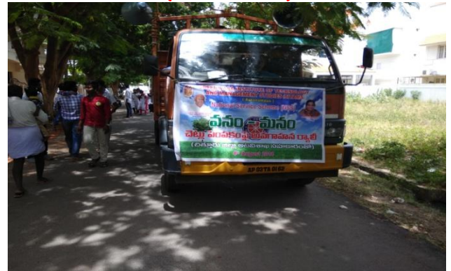
Plantation Awareness Rally by distributing tree saplings (04-08-2018)