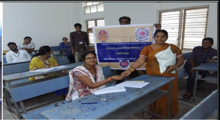
Swine Flu Prevention Homeopathy Pills distribution to all the Students and the Staff (14-11-2018)