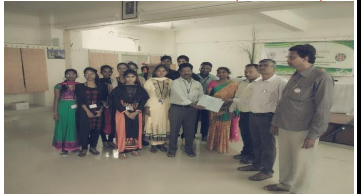
University Level Youth Festival Competitions (11-12-2018)