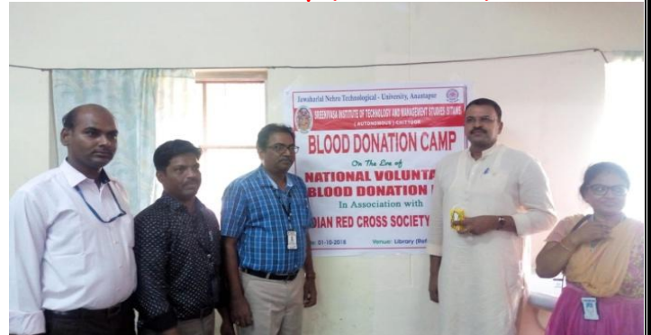
Blood Donation Camp on the eve of National Volunteer Blood Donation Day (01-10-2018)