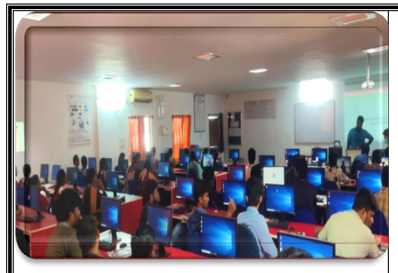
National level workshop on "Image Processing Using MAT Lab" on 10<sup>th</sup> July 2019.