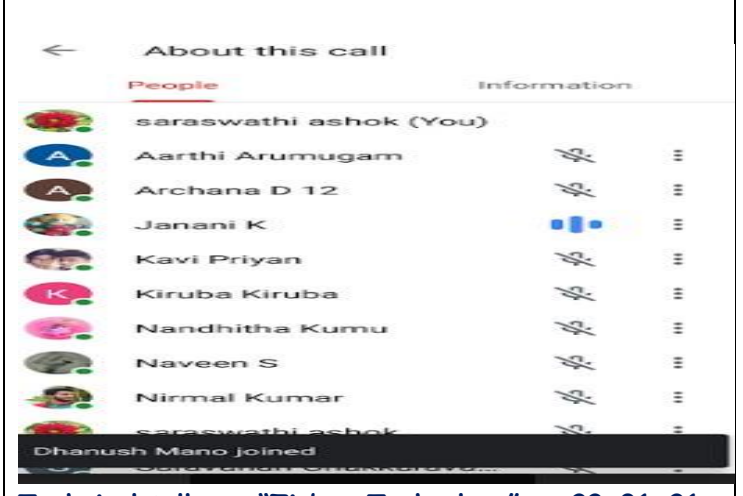
Technical talk on "Zigbee Technology" on 22-01-21.