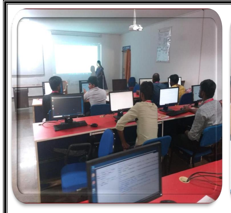
Guest lecture on "Module: An Online E-Learning Platform" on 24<sup>th</sup> February 2021.