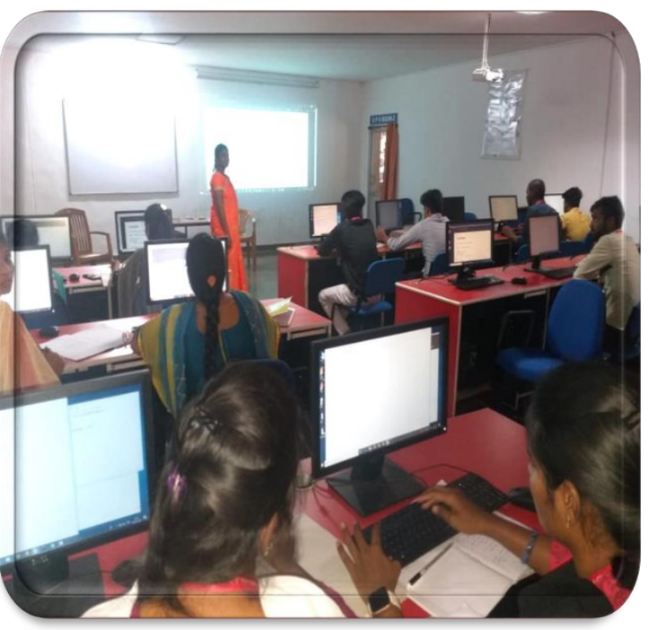
Seminar on "IP Commercialization, its importance, challenges and way forward" on 05<sup>th</sup>March 2021.