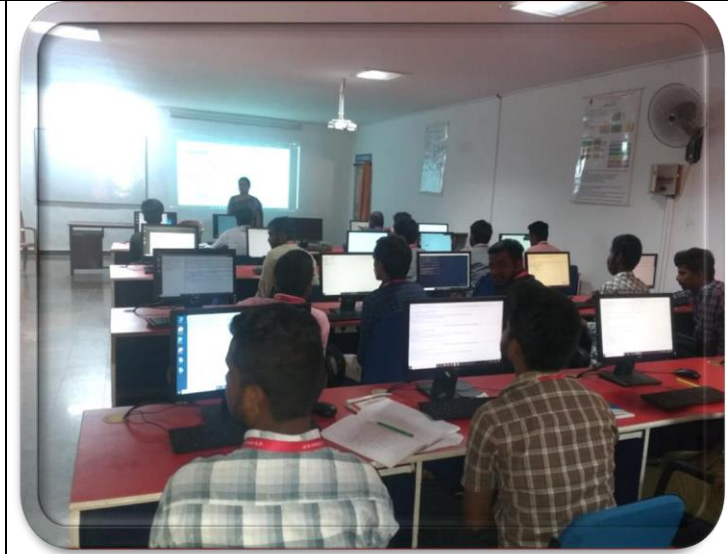
Webinar on "Research during Corona Period for Students and Faculties" on 2<sup>nd</sup> January 2021.