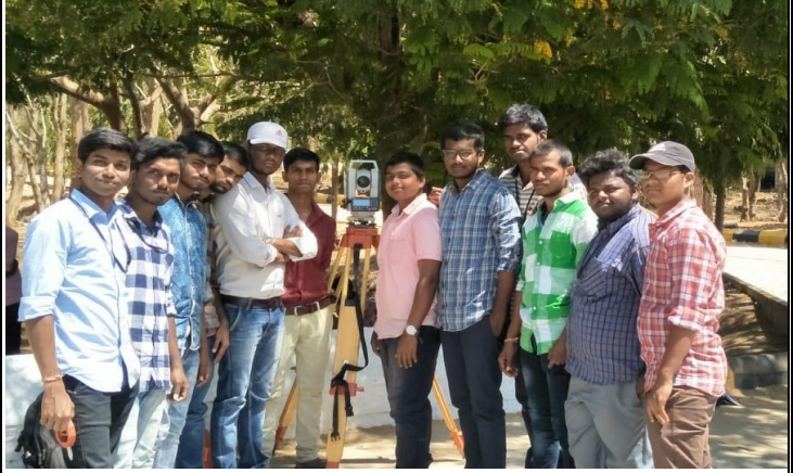
One week national workshop on land survey using total station 01 march to 07 march 2017