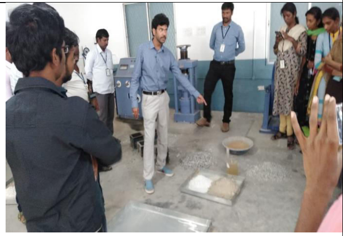
One day national level workshop on development of self-compacting concrete on 25th January 2019