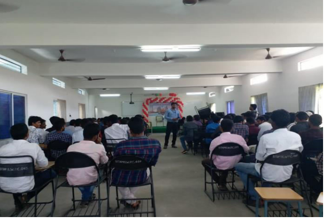
Fare well day on 26th March 2019