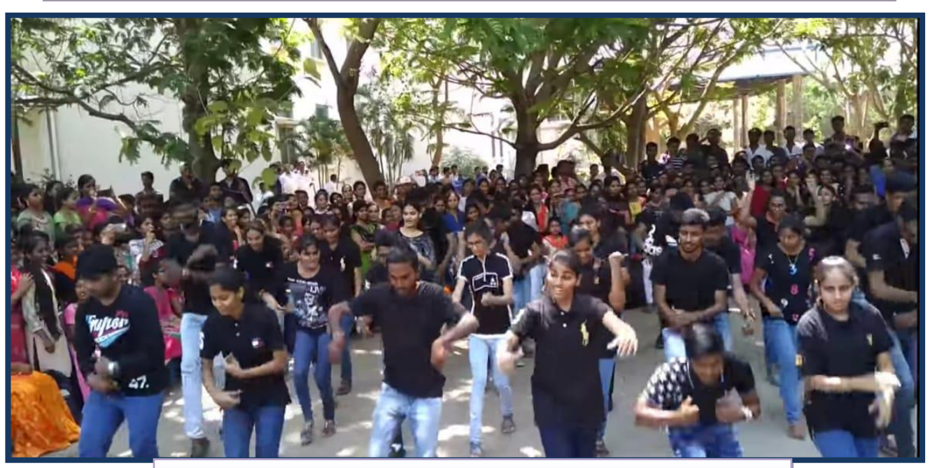
Flash Mob by the SITAMS students on the Eve of SITAMS Vaibhav-2K19