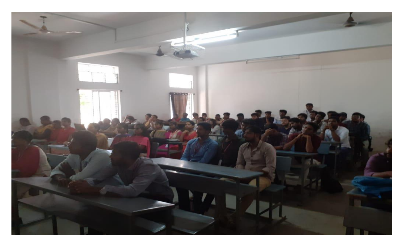
Audience of the Programme

.At the end, the chief guest was felicitated by the ED Cell and workshop was ended with National Anthem.