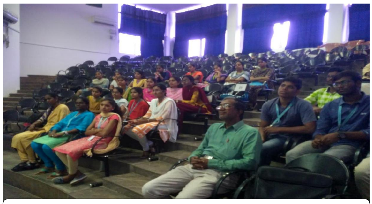
Audience of the Programme