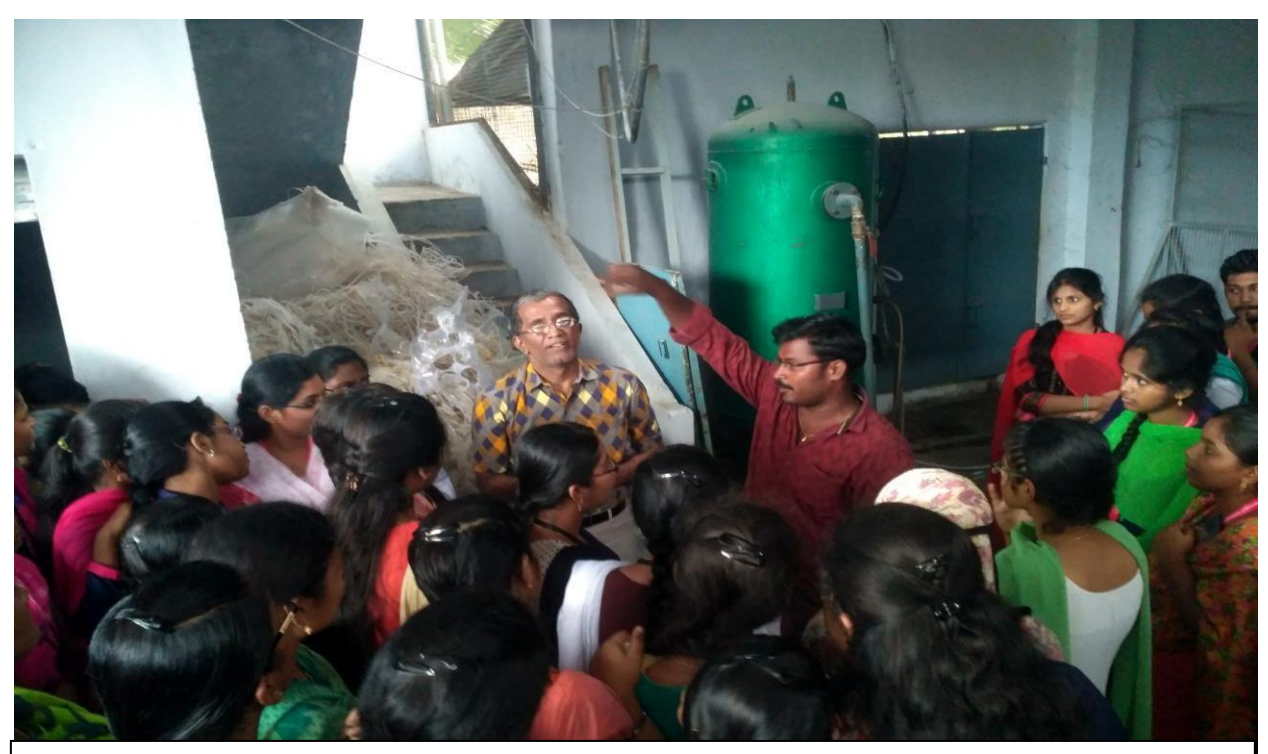
General Manager of an Enterprise is explain about the process of production