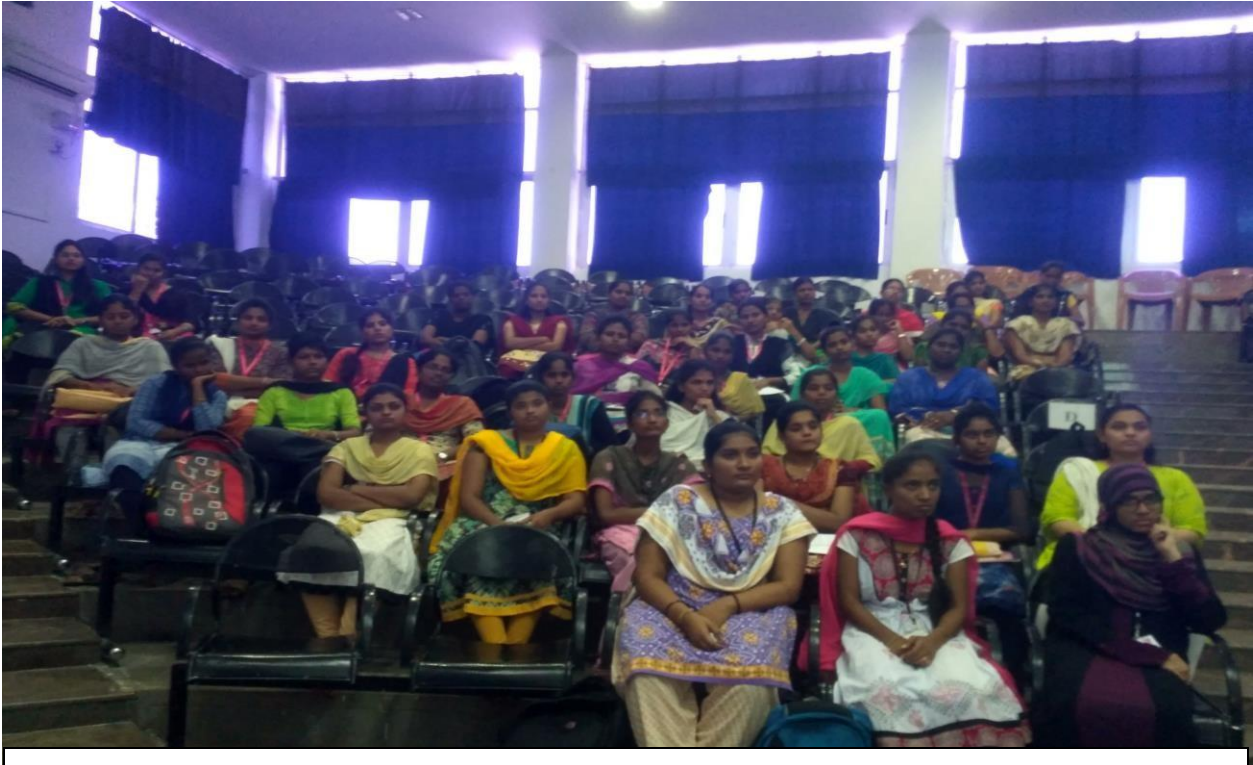
Audience of the Programme