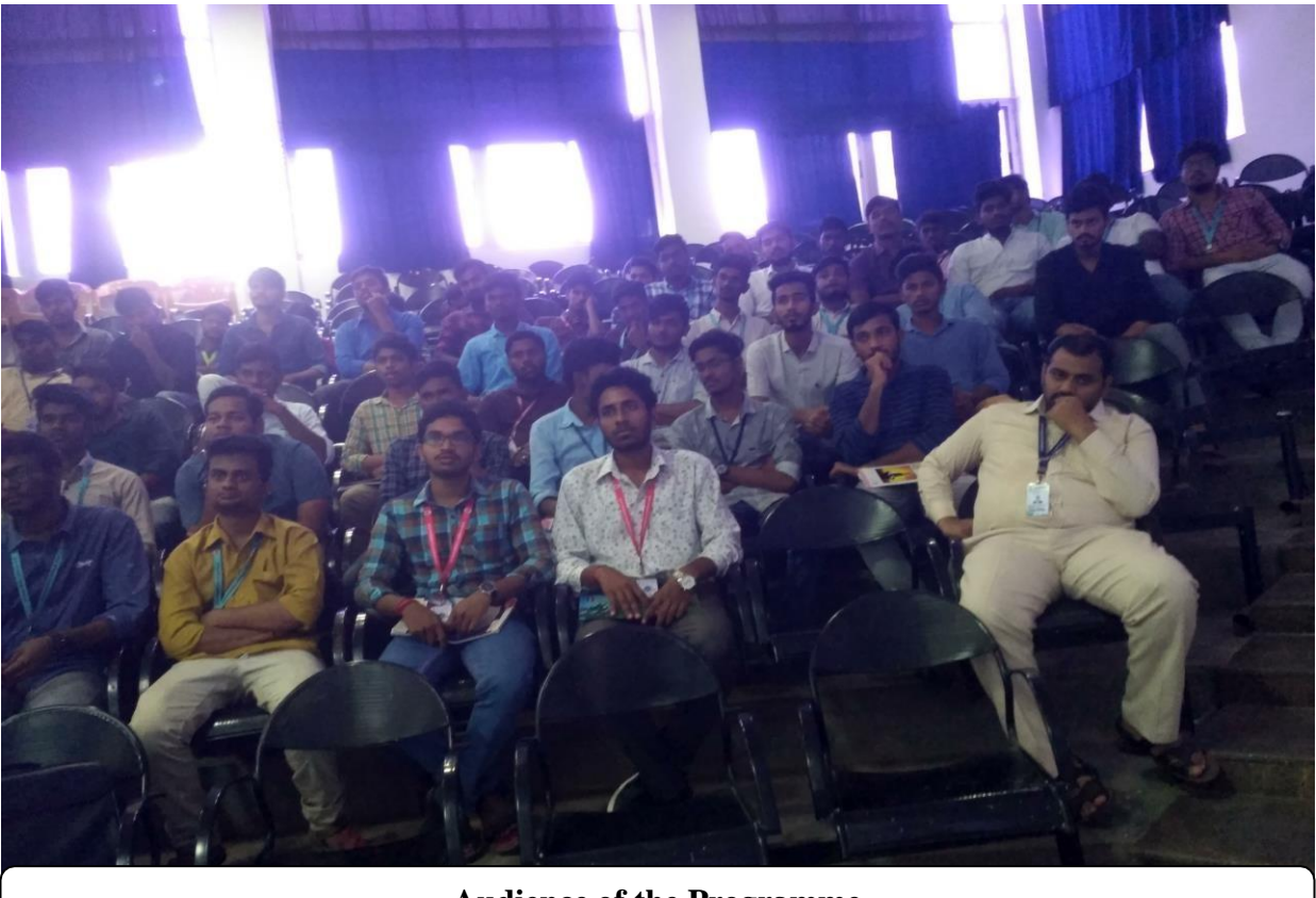
Audience of the Programme