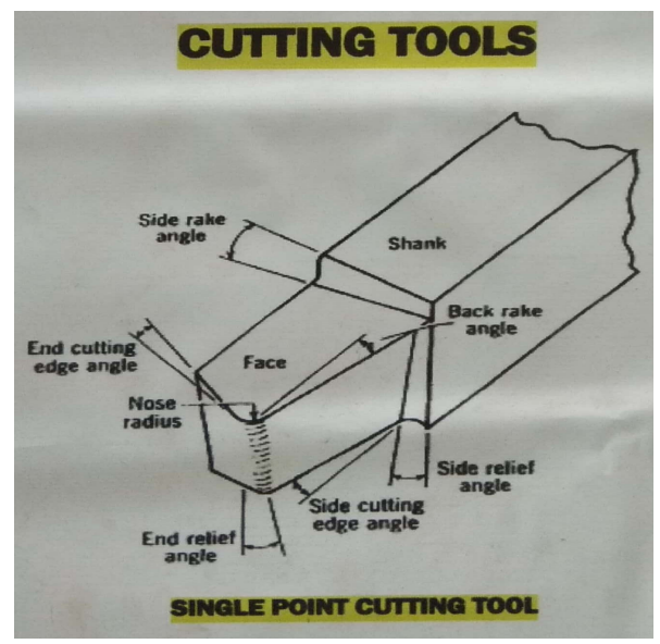
Machine Tools Technology Lab