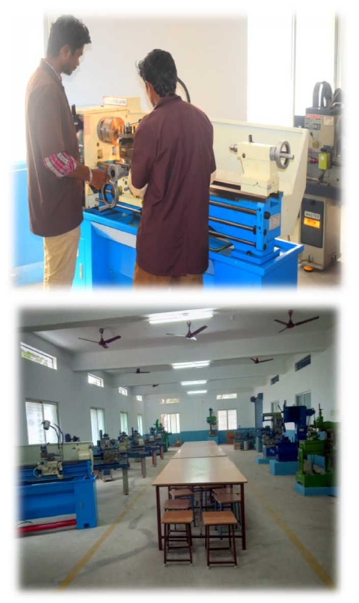
Machine Tools Technology Lab

The machine tools technology lab prepares students for employment in machine shops, tool rooms, instrument and experimental laboratories which provides upgrade opportunities for employed industrial personnel. Students gain proficiency in the set-up and operation of drilling machines, lathes, mills, grinders etc. Students completing the program may enter industry as an advanced apprentice machinist or machine operator and anticipate advancement to machinist, tool and die maker experimental machinist.