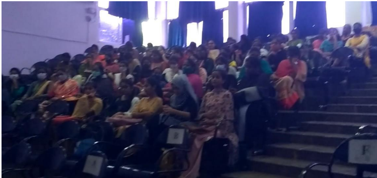
Audience of the Programme