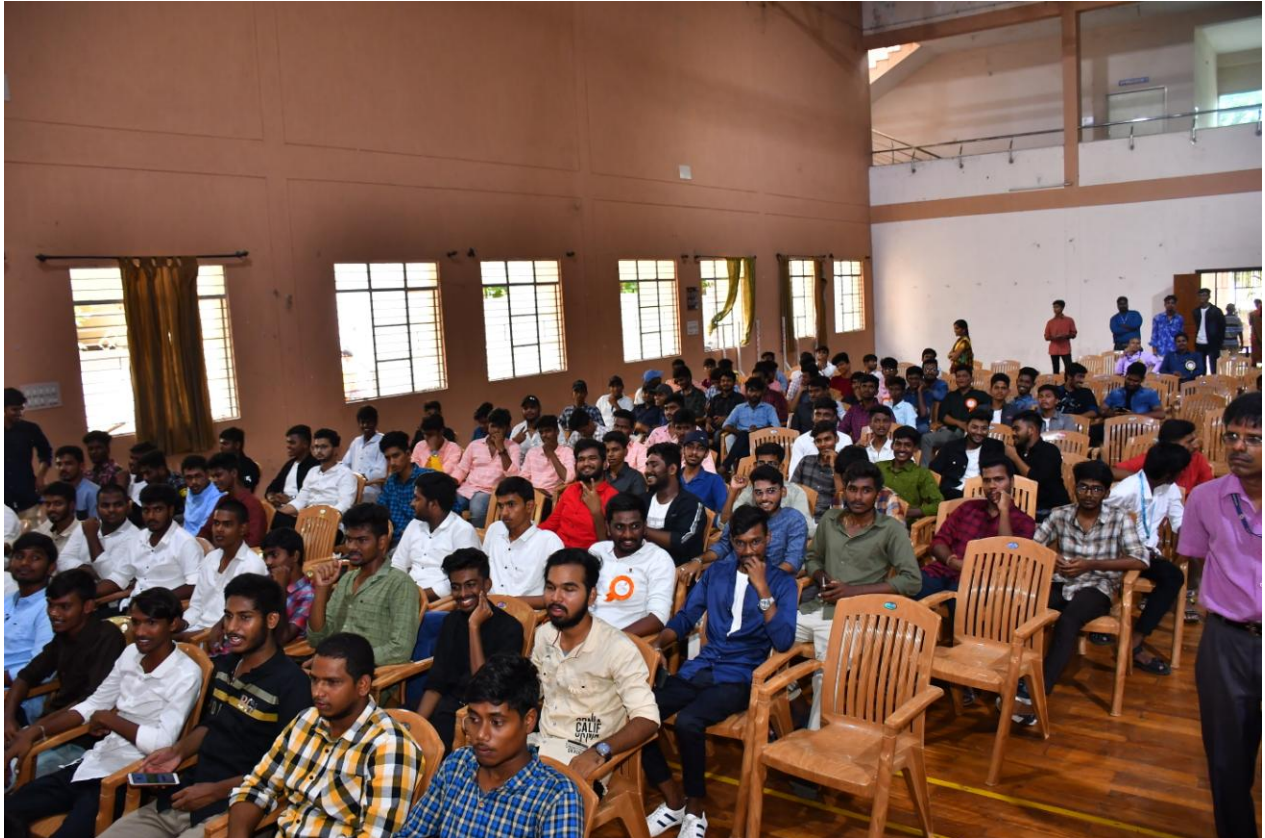
Audience of the Proramme

After attending this seminar, students were enlightened and got awareness on starting a new business and what the reason for success.